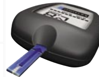
Special test strip for precisely defined blood sample