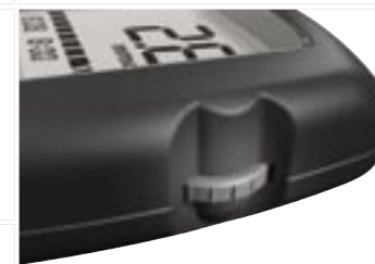
Multi-functional scrolling wheel for easy handling