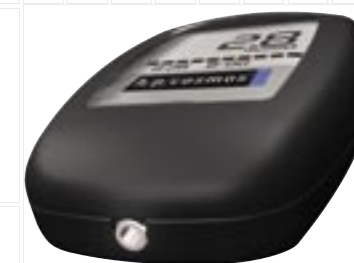
Interface for data transfer

Manufacturer: SensLab GmbH Bautzner Straße 67, DE 04347 Leipzig